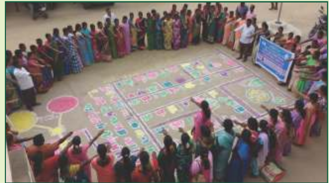
Muzhu Sugaathara Thamizhagam - Munnodi Thamizhagam