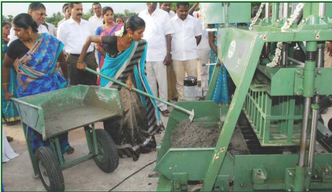
Hollow Block Making Unit, Cuddalore