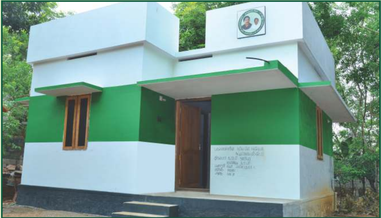
Chief Minister's Solar Powered Green House