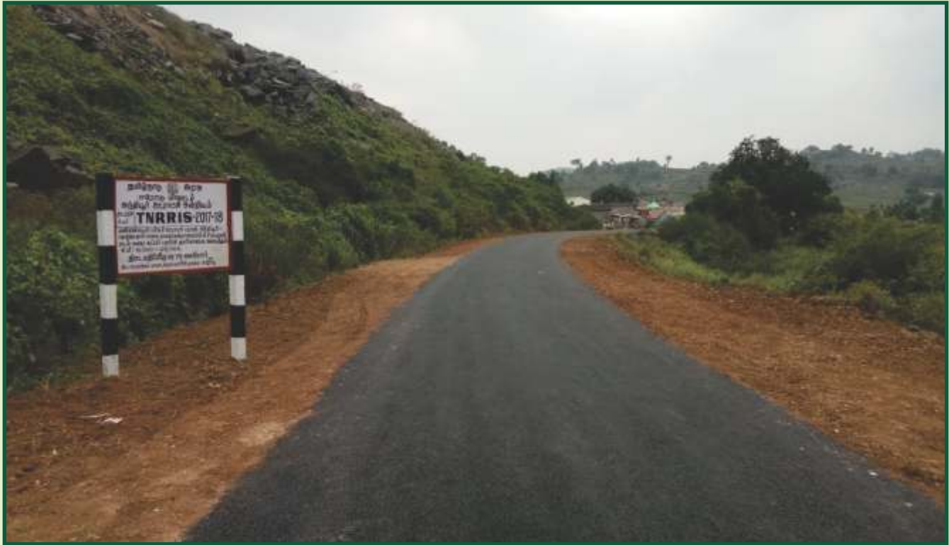
Formation of Black Topped Road