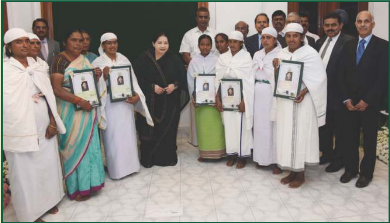
Loans and Vehicles being handed over to Common Livelihood Groups (The Nilgiris) involved in Tea Cultivation