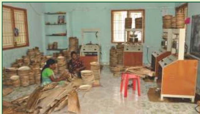
International Fund for Agricultural Development (IFAD) assisted Post Tsunami Sustainable Livelihood Programme (PTSLP) Activities