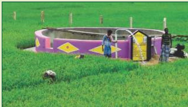
Mahatma Gandhi National Rural Employment Guarantee Scheme Activities