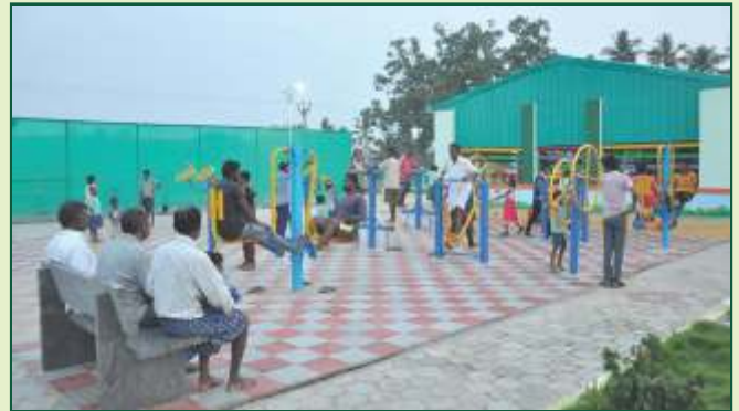
Amma Park and Amma Gym