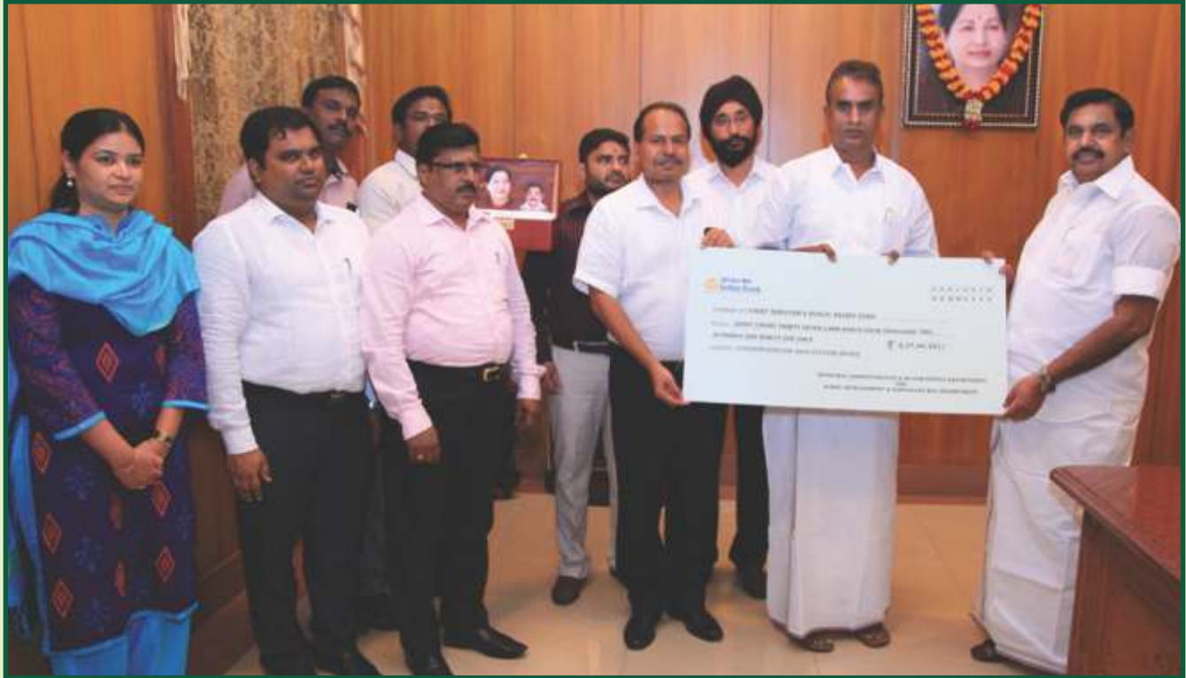
Contribution towards Gaja Cyclone Relief Fund presented to Hon'ble Chief Minister of Tamilnadu