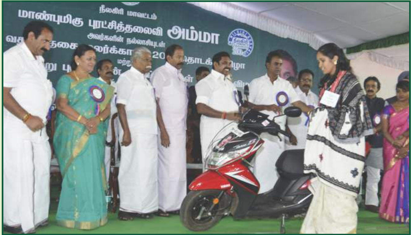
Distribution of Amma Two Wheelers at The Nilgiris (18.05.2018)