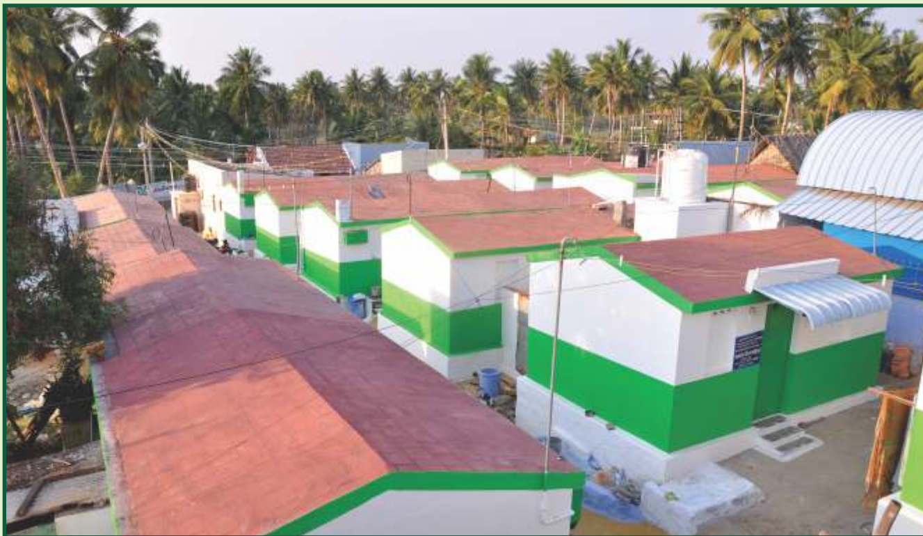
Repairs to Houses constructed under various Government Schemes