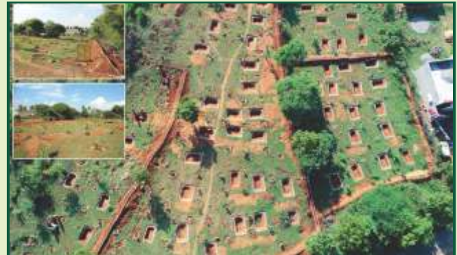
Mahatma Gandhi National Rural Employment Guarantee Scheme Activities