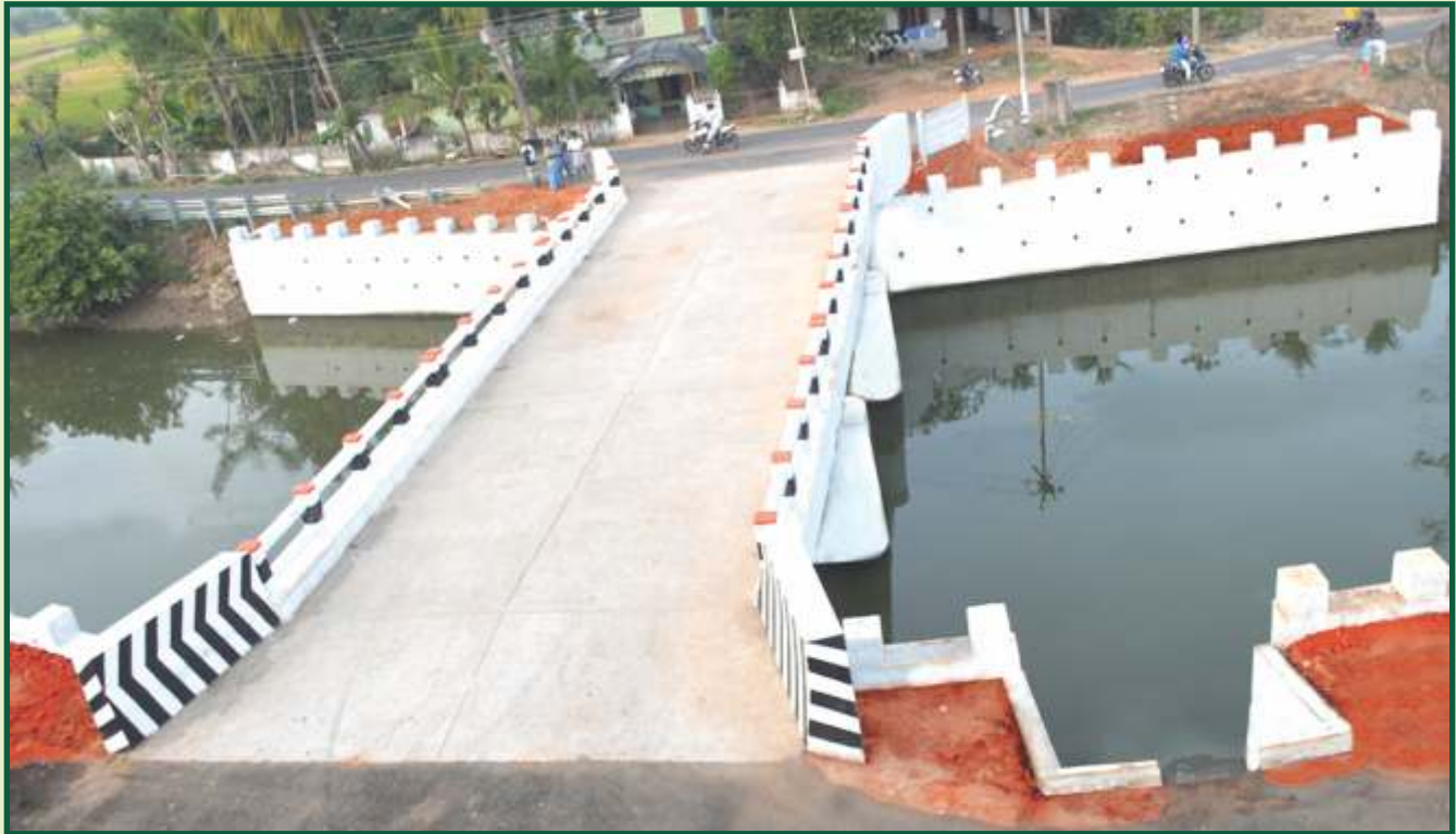
Construction of New Bridge