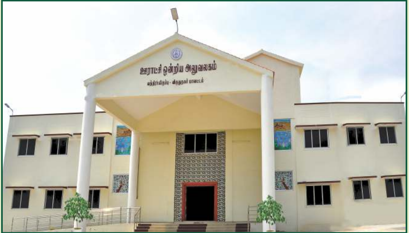
New Panchayat Union Office