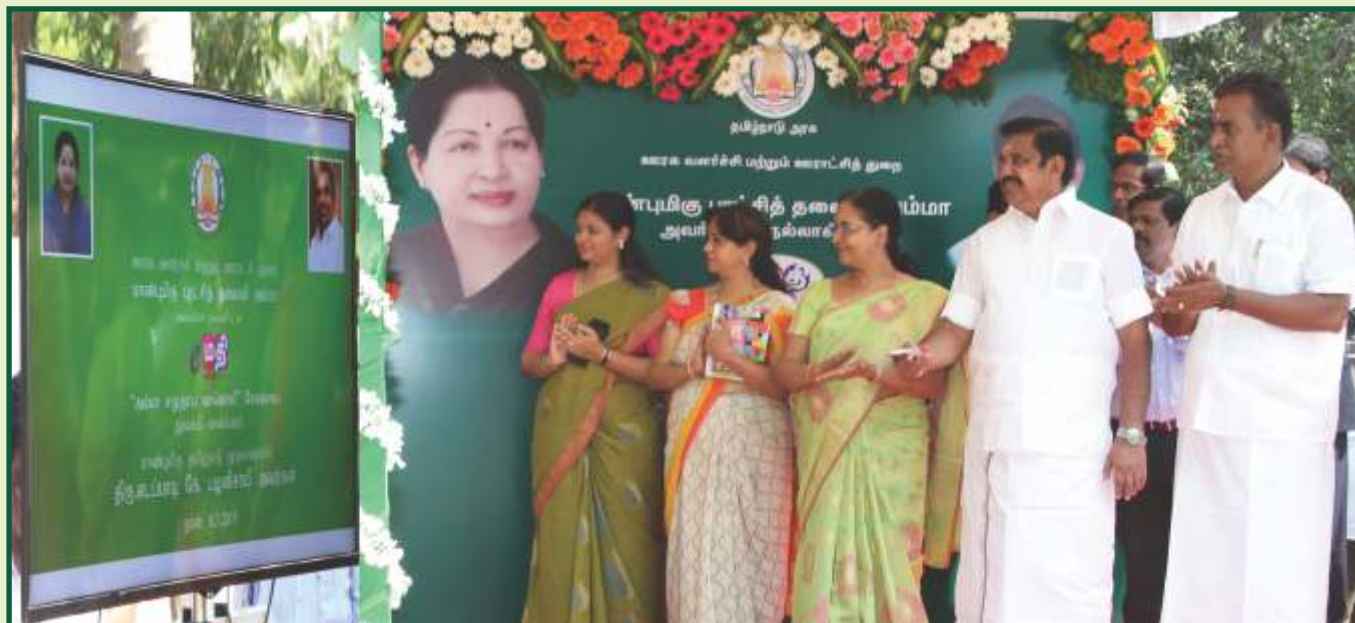
Launch of Amma Community Radio for SHG Members through e-Mathi App