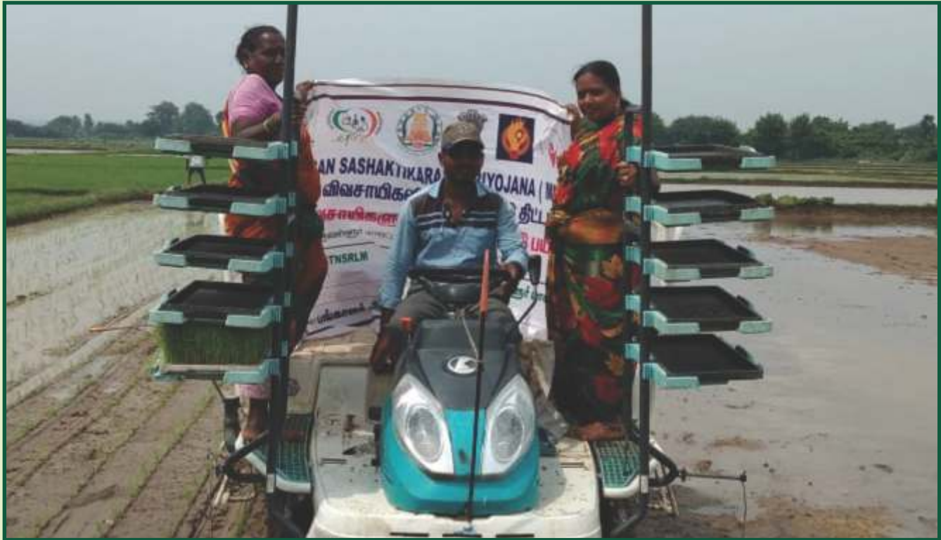
Training in SRI - Paddy Sowing given to Mahila Kisans in Madarpakkam Village, Gummidipoondi Block, Tiruvallur District under MKSP Scheme