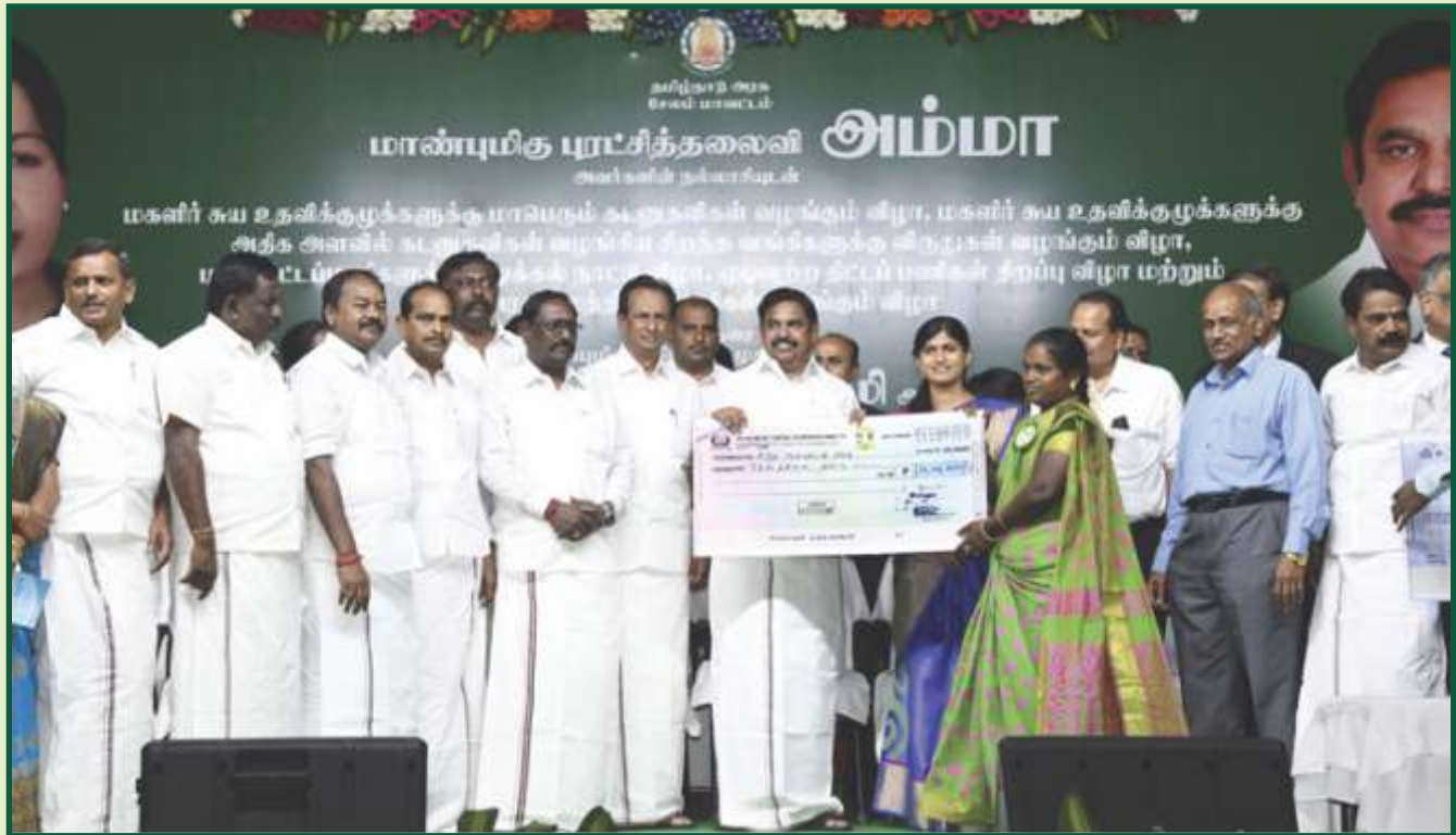
Mega SHG Loan Mela at Salem (25.02.2019)