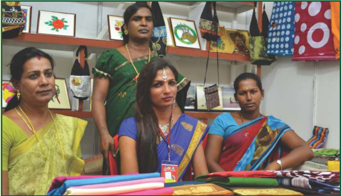
Transgender Special Self Help Group at State Level Exhibition Stall for SHG Products